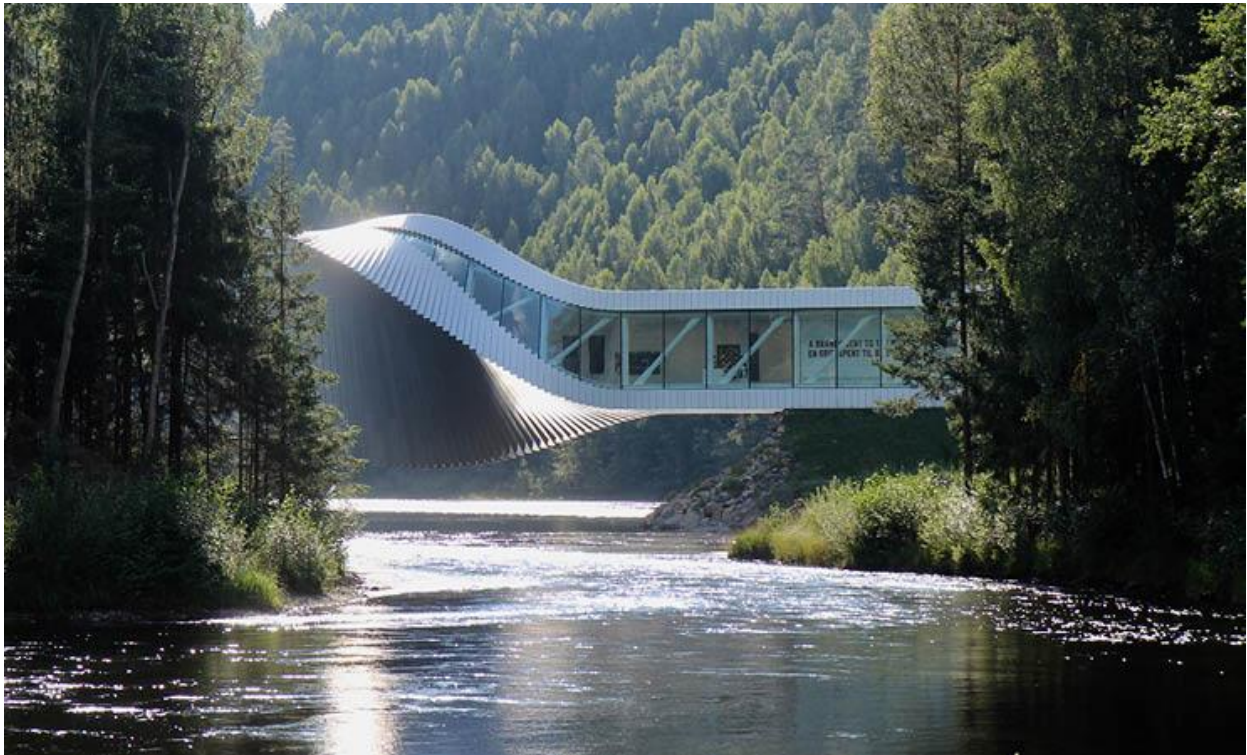
The art gallery The Twist , opened in 2020. © Arvid Høidahl.

Established by the entrepreneur Consul Anders Sveaas (1840 – 1917) in 1889 as a woodpulp factory , Kistefos is the only pulp mill - of the 100 once existing in Norway powered by waterfalls - that has preserved both buildings and production equipment almost in its entirety as it was in 1955, when the production of wood pulp was transferred to Follum Fabrikker. Kistefos, therefore, conveys industrial history that is unique in Norwegian and Scandinavian contexts.