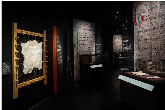
Upholding the law: Magnus the Lawmender’s Law of the Land, 1274-2024.