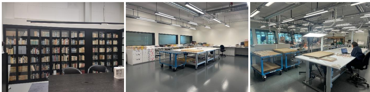
The Ekely Room and the paper conservation studio at MUNCH.