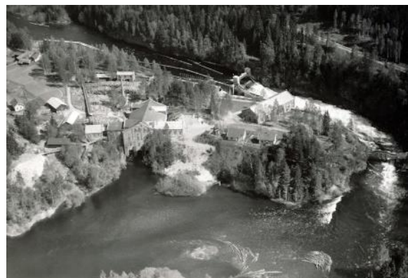
The woodpulp factory as it was in the 1950s.

The Twist is an art gallery, a bridge and a sculpture all in one, and has won several awards for its cutting-edge design by the Danish star architects BIG - Bjarke Ingels Group. In 2020, Kistefos was named a “must-see cultural destination” by The New York Times .