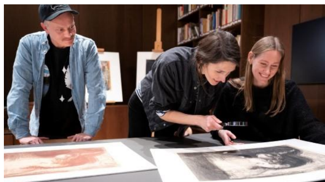
Study room in the department of prints and drawings.